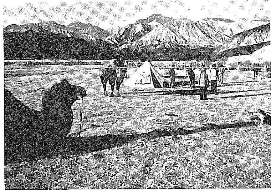
Fig. 2. The Tulai Nanshan in northern Qinghai is rugged and barren. We are camped by a willow-bordered creek in a valley of the Shule Nanshan. 10 October; 3200 m.

shrubs ( Kaladium , Salsola ) and a sparse cover of grasses and sedges along seepages (Fig. 3). However, the eastern Kunlun and the Anyemaqen Shan may have good pasture, and north and west-facing slopes may be covered with dense shrub ( Salix , Potentilla ) and patches of Juniperus forest that extend upward to 4400 m.