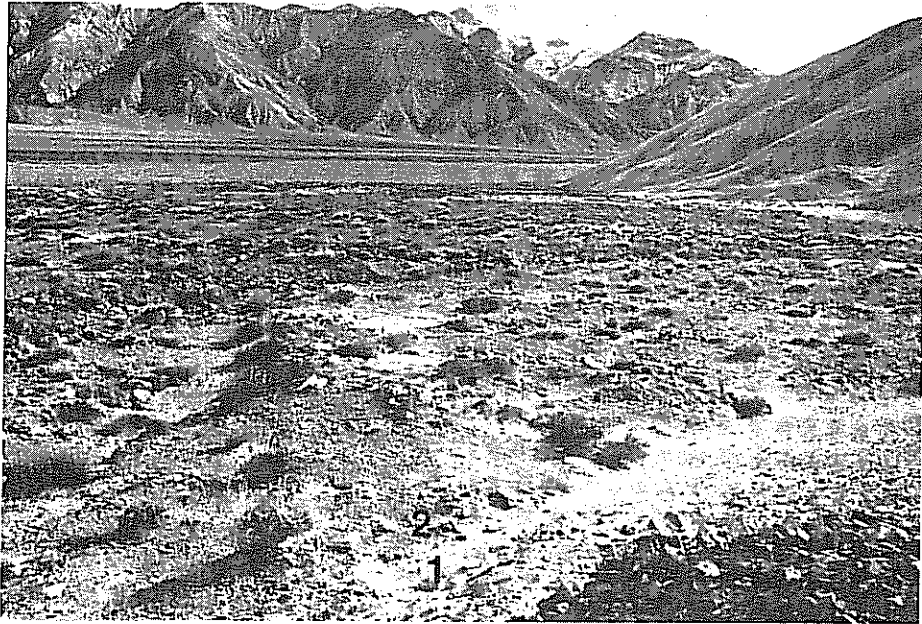
Fig. 3. Broad valleys break the eastern Kunlun Shan. Snow leopards often travel along the base of the hills and leave scrapes (just left of 1) and droppings (just left of 2) at the tip of spurs projecting into the valley. 3 December; 3800 m.