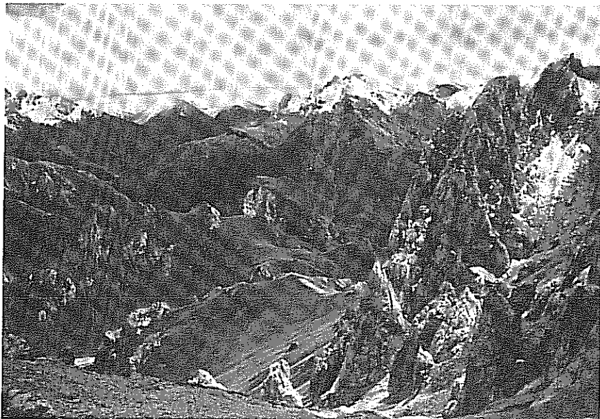
Fig. 4. Typical snow leopard habitat in the northern Zadoi area of southeastern Qinghai consists of limestone massifs. 28 August; 5000 m.