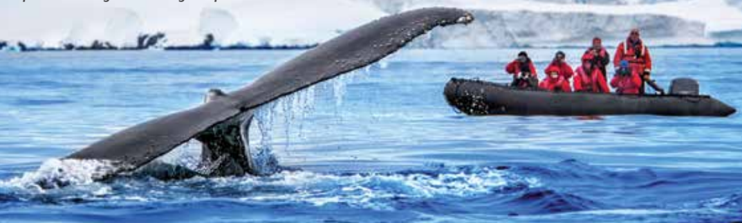
Up-close viewing of breaching humpback whales

Flanked by towering glacial cliffs between the Antarctic Peninsula and Booth Island, cruise through the Lemaire Channel, where seven miles of mountains and interweaving patterns of floes brim with wildlife. (B,L,D)