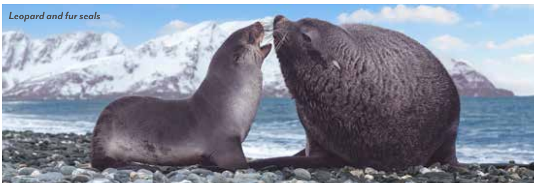
Leopard and fur seals