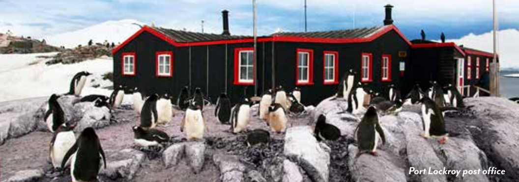
Port Lockroy post office

Legendary explorers and aviators ushered in the Heroic Age of Antarctic Exploration with gripping tales of their journeys—spearheading technological advances that laid the foundations for the mechanical age of discovery. Admiral Richard Evelyn Byrd accomplished the first flight over the South Pole during the U.S. expedition of 1928, utilizing groundbreaking navigational technology. His subsequent expeditions to Antarctica would greatly advance polar research and mapping of this strange new land. One of the most remote regions in the world, Antarctica remains the only continent not to have a native human population.