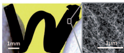
Figure 1. Photograph of the flexible CNT rubbery materials developed by Xu et al. Inset: SEM image of the area marked in the photograph. Adapted from Ref. [3].

Recently, Hata and co-workers at the AIST and JST in Japan developed new viscoelastic material from carbon nanotubes (Figure 1) that is similar to silicone rubber, but