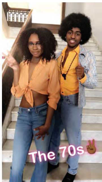
Students represent the 1970s during the Black Student Union event.

The CWRU campus community enjoyed a range of art, music, dining and literature during the month of February as various departments, offices and organizations celebrated 2018 Black History Month.