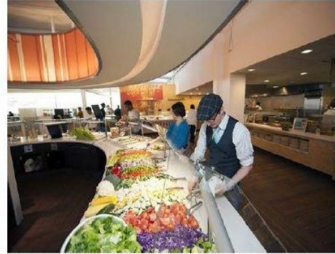
Leutner Dining Hall, North Residential Village