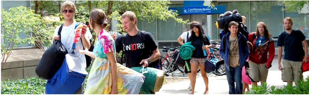
Students move into CWRU North Residential Village