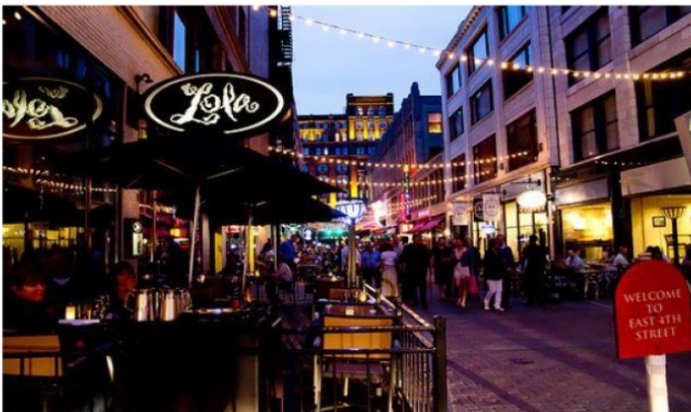
Above: East 4th Street in downtown Cleveland is the heart of the city's vibrant culinary scene.

In its list of “America’s Best Food Cities” for 2015, Time.com ranked Cleveland in seventh place, ahead of San Francisco (#19), New Orleans (#15), Chicago (#13), New York City (#10), and Los Angeles (#9). Whether you want to try Cleveland’s traditional Polish-influenced cuisine, trendy fusion bar foods, or New-American dishes developed by Michael Symon, Cleveland’s own Iron Chef, there’s something to please every palate.