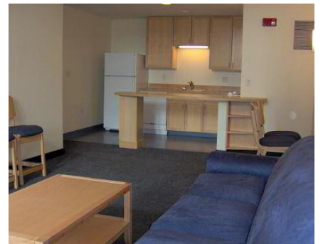
Top (Left to Right): The Village at 115 th ; Pierce Dorm in North Residential Village; The Apartments at 1576 Bottom (Left to Right): Single room in South Residential Village; Common room in the Village at 115; Suite kitchen in the Village at 115th