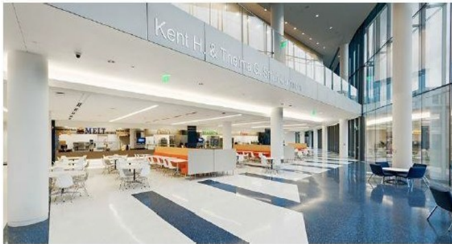
Tinkham Veale University Center dining featuring Melt, Cool Beanz, Naan, Pinzas, 8Twenty6, and Michelson & Morley

Students who live on campus will have meals in campus dining halls. The cost of the meal plan will vary depending on the plan they choose. Students on the Case Western Reserve meal plan are permitted to dine at a variety of locations on campus, including Leutner and Fribley traditional dining halls, Grab-It and Bag-It, Tomlinson Café, and Tinkham Veale Center restaurants, many of which serve dishes made on-site daily using locally sourced meats, produce, dairy, and bread products.