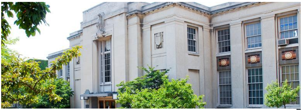
Top Left: Students on DiSanto Football Field Top Right: CWRU Orientation Leaders Bottom: Center for International Affairs, Tomlinson Hall