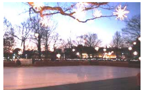
Left: Severance Hall (Top) ; Wade Oval Wednesday (Bottom)