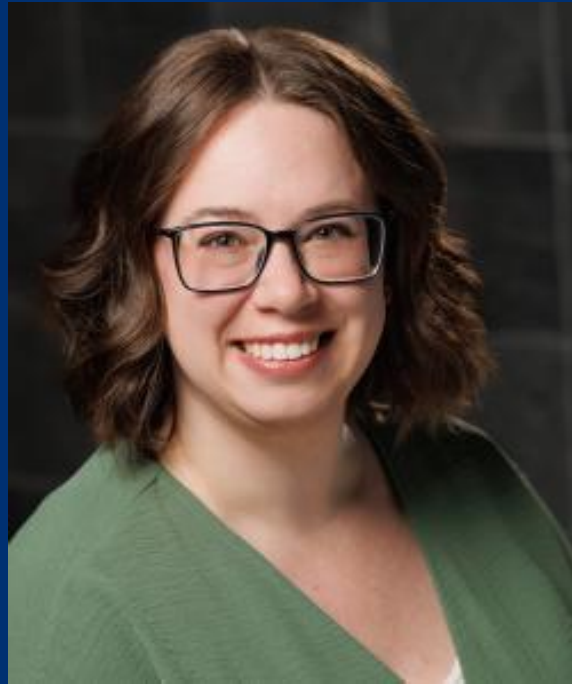
Leah Jeunette President's Award for Distinguished Service