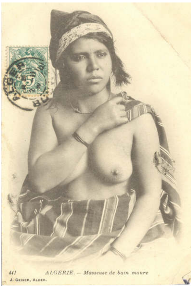
(figures 6, 7, 8)

In recognizable sub-categories generically designated as “Femme arabe,” “Mauresque,” and “Bédouine,” pejoratively reductive appellations like “Belle Fatma,” “Aïcha,” and “Khédiya,” or specifically identified with a group like the Ouled-Naïl (the women of a nomadic southern tribe highly fetishized in colonial discourse for their exotic beauty and often associated with prostitution), the exotic North African woman is depicted alone, in pairs, and in groups, idle (clothed, bejeweled, unclothed, reclining in a odalisque position, etc.), or engaged in what purports to be an emblematic activity (standing at the window,