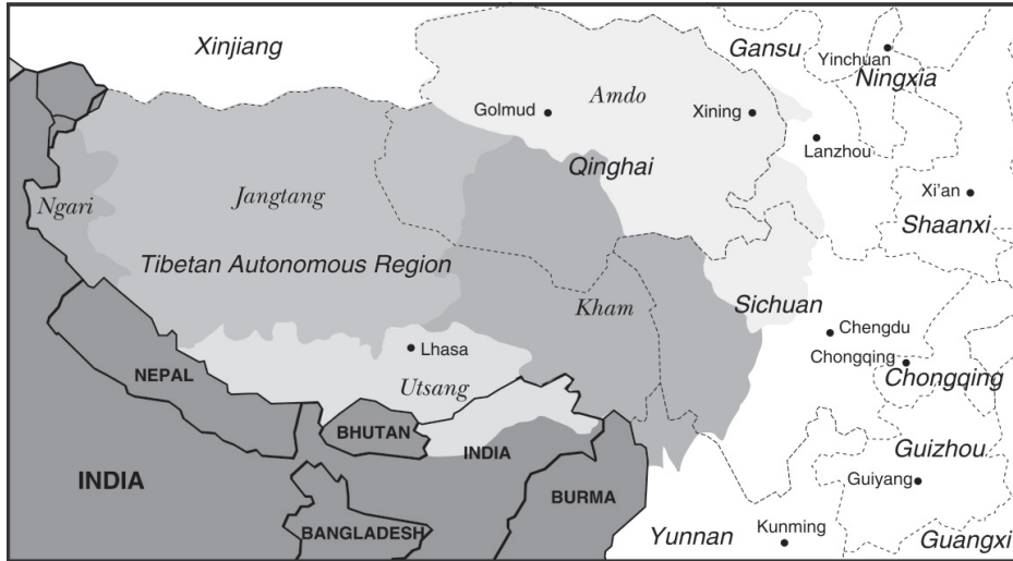
FIGURE 1 Tibetan cultural areas and western provinces of China

NOTE: The five shades of gray distinguish the indigenously designated Tibetan regions of Amdo, Kham, Utsang, Jangtang, and Ngari.