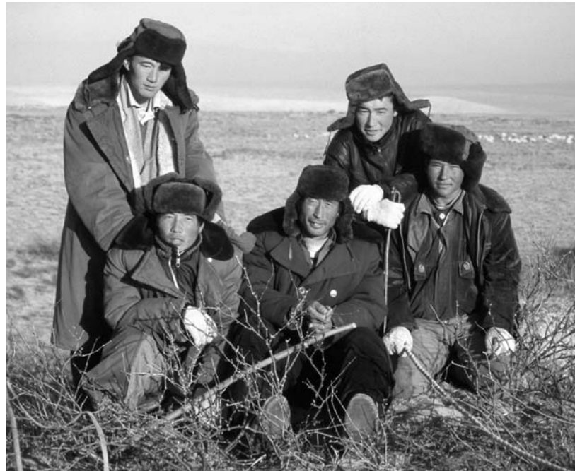
FIGURE 3 Group-herding arrangements make possible economies of size with respect to herd supervision. Illustrated is a Kazakh herding group in spring–autumn pasture, Burqin, Xinjiang. De facto collective tenure persists in this pasture in part because of its patchy nature and the related difficulty of subdividing it equitably between groups or households.

The local-level arrangements for grassland management described in the previous section are molded by the economic, social, and ecological realities of pastoralism in western China. Rangelands are by nature extensive, of low productivity per unit of area, and spatially and temporally variable. This makes the net benefit of establishing private exclusion through fencing marginal at best, which is reflected in the frequent comment of pastoralists that even if they wanted to fence their pastures, they could not afford to. Instead, exclusion is more economically achieved through a combination of collective or group tenure arrangements, which are associated with shorter boundaries to be monitored and enforced, the direct observation of herders in the field, and the stationing of grassland protector households to ensure seasonal exclusion. Collective and group tenure arrangements also facilitate group-herding arrange-