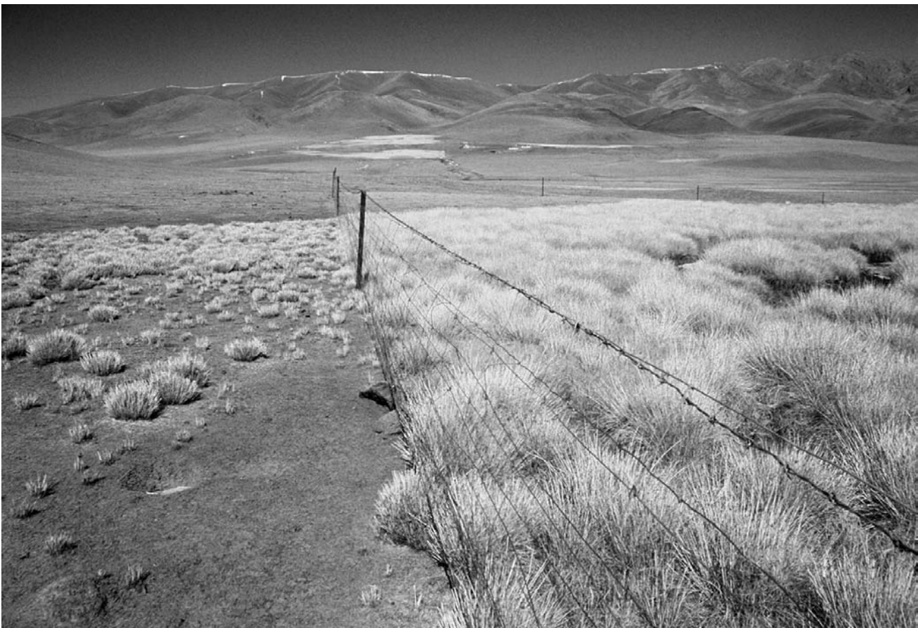
FIGURE 4 The fencing of swamp grassland in Naqu, Tibet, represents a case of a collective tenure and management regime. Household access to the fattening pastures resulting from such an arrangement is effectively controlled by the collective.

The Naqu County government of the TAR, with financial support from the Tibet Poverty Alleviation Fund, has established a number of fattening pastures that have been formally contracted to the village (either administrative or natural) as a whole. The location of boundaries was decided through consultation with com-