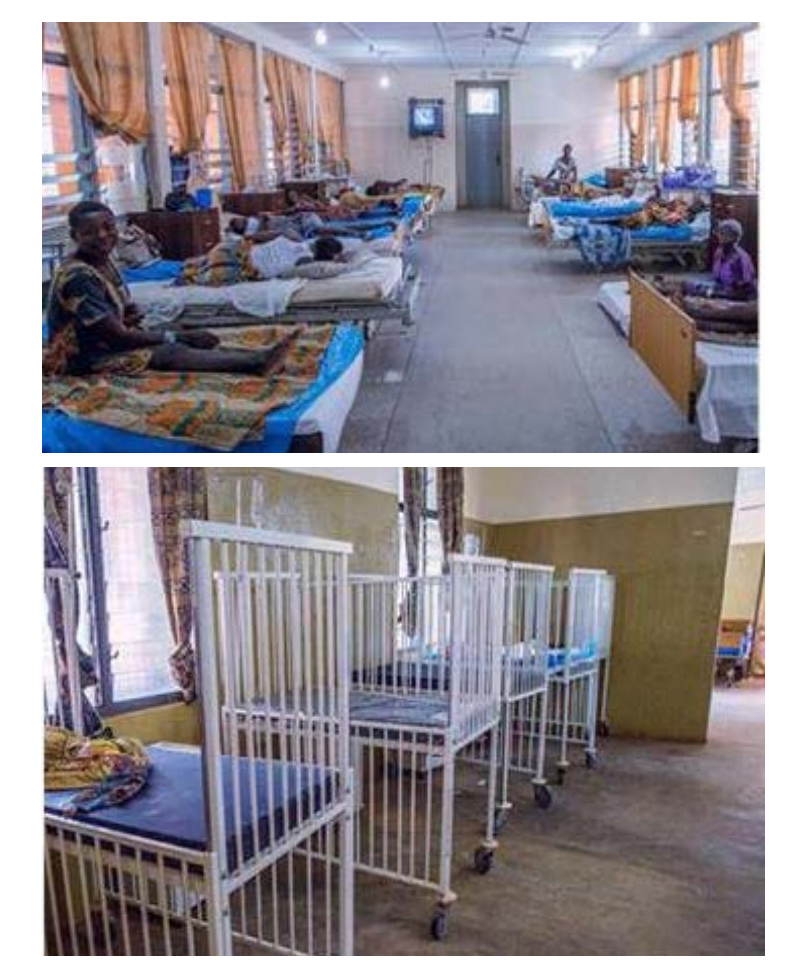
Nadowli Hospital, Ghana, 2014

determine which devices are worth pursuing, we test each device, document and package them for MedWish to send to countries that have requested critical devices, such as pulse oximeters."