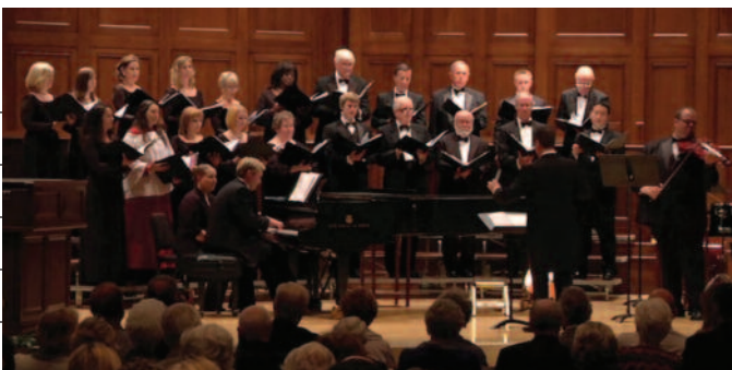
The Vero Beach Rotary Club and Songs for Peace sponsored a recent concert in Vero Beach, featuring The Atlantic Children’s Chorale (right) and the Atlantic Schola Cantorum Orchestra.