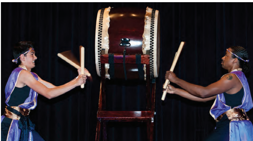
Mame Daiko, a traditional Japanese Taiko drum ensemble sponsored by the Cleveland Chapter of the Japanese Americans Citizens League, performs during the CWRU 2012 International Dinner event.

An increase in the enrollment of international students at Case Western Reserve University in recent years is providing greater diversity on campus and moving the university closer to its goal of internationalizing the campus.