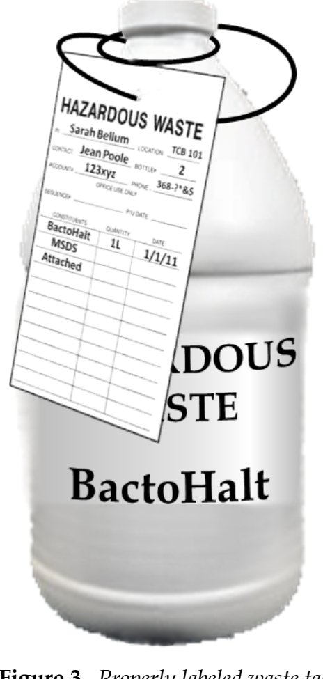
Figure 3. Properly labeled waste tag for commercial product.

Attach the Waste Tags to the properly labeled waste containers. Commercial chemicals with proprietary ingredients may be entered as the product trade name, as long as there is an attached MSDS (Figure 3). As always, when in doubt, call the EHS office.