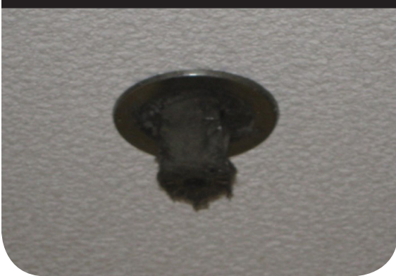
Dirty Sprinkler Head