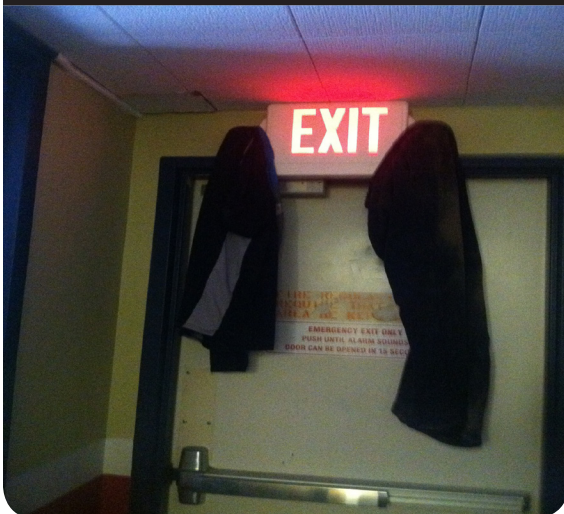
Covering of Lights