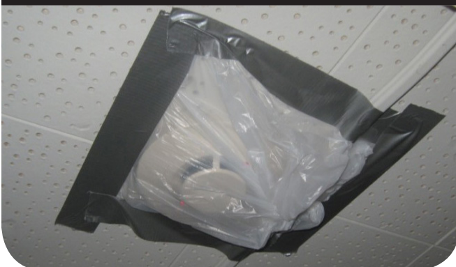
Covered Smoke Detector