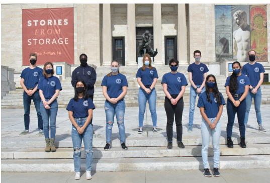
Fall 2020 EMT Class

Despite the pandemic, 15 students graduated from the Fall 2020 UH EMS EMT course. In Spring 2021, an additional 13 students graduated from the course. Both classes had a 100% passing rate! We are exceptionally proud of our new EMTs and look forward to seeing them in action.