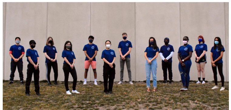
Spring 2021 EMT Class