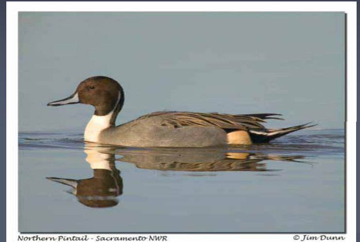
Northern Pintail - Sacramento NWR