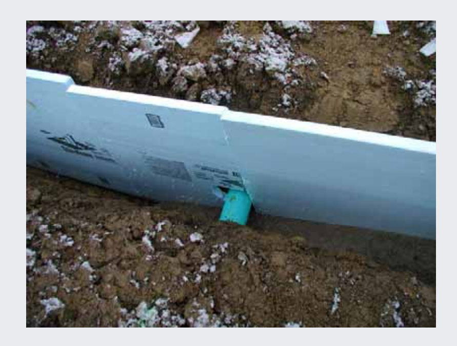
Foundation with insulating material