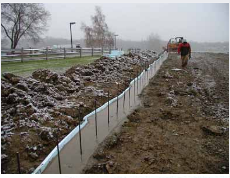
CASE WESTERN RESERVE UNIVERSITY