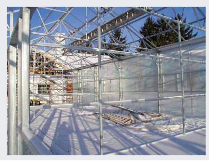
Feb 27-28, 2006