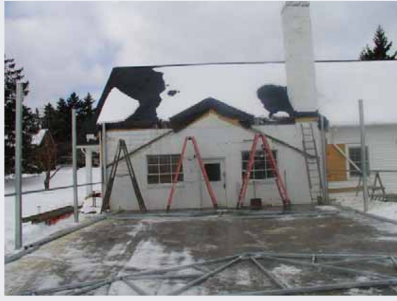
Feb 9 -10, 2006