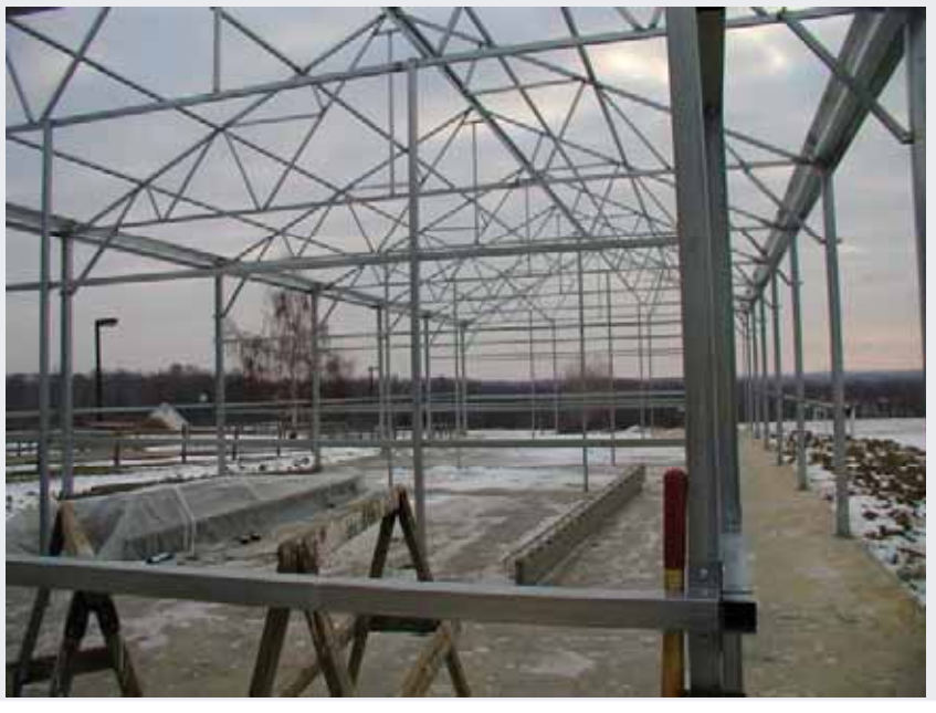
Feb 20-21, 2006