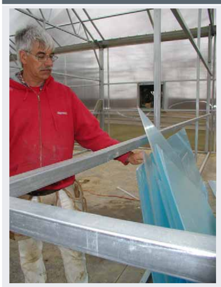
8 mm double poly walls coated for condensation resistance and UV protection