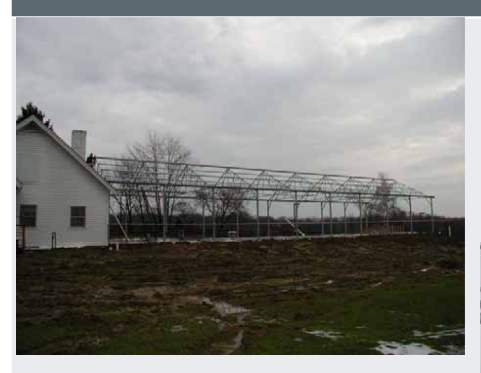
Feb 16, 2006