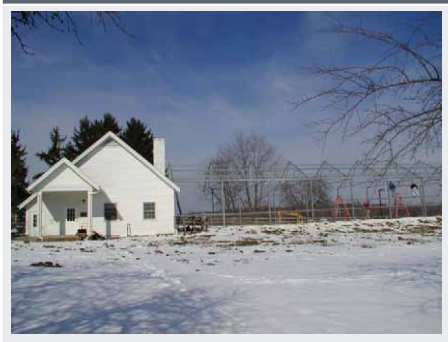
Feb 15, 2006