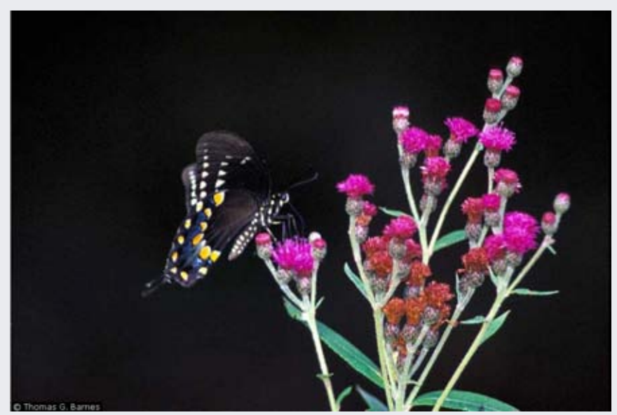
USDA NRCS Plants Database