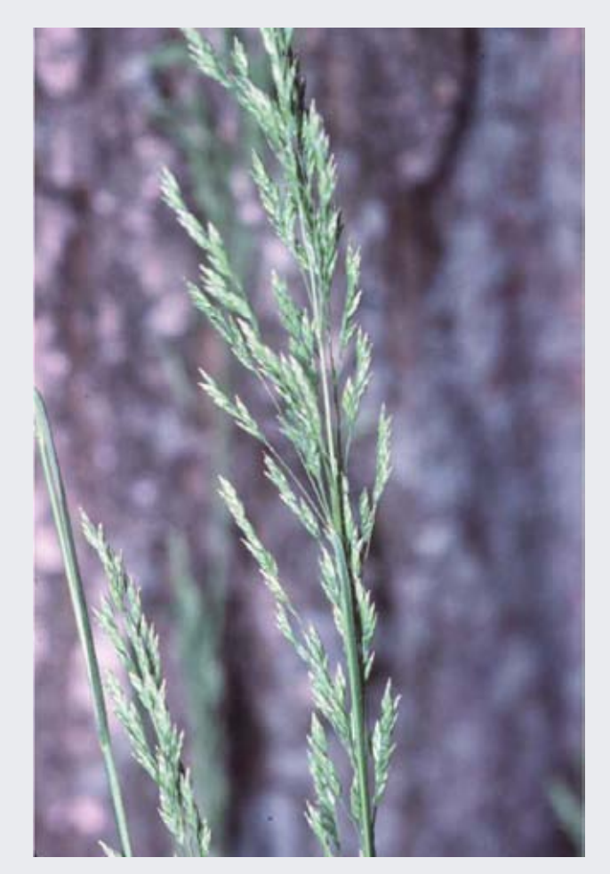
USDA NRCS Plants Database