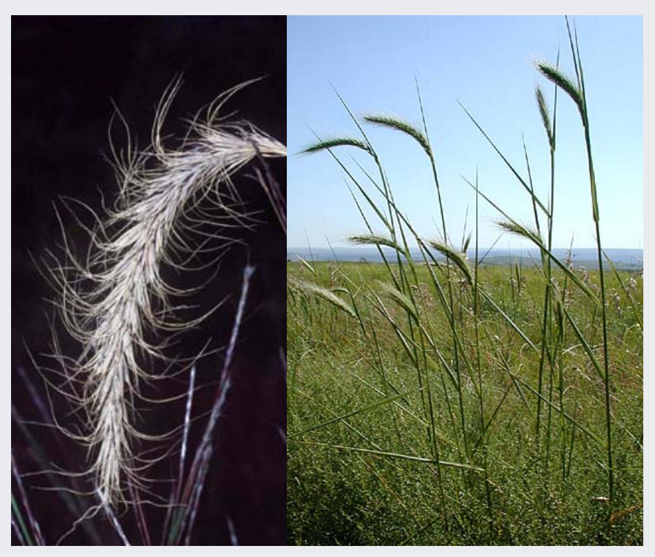
USDA NRCS Plants Database