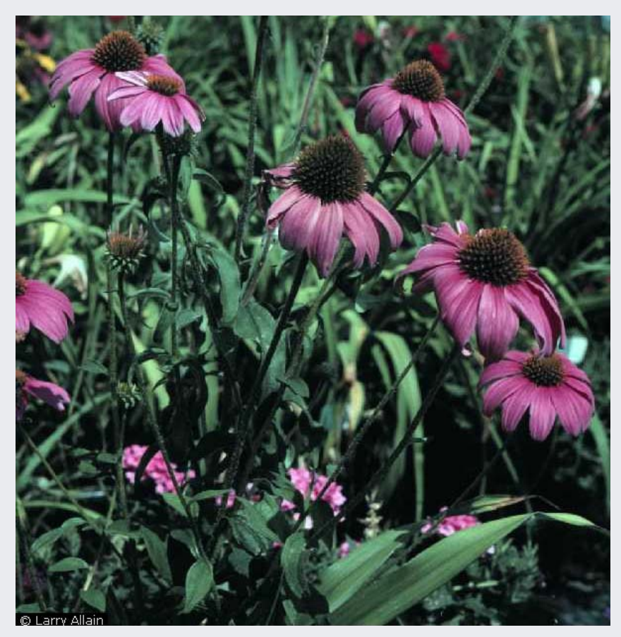
USDA NRCS Plants Database