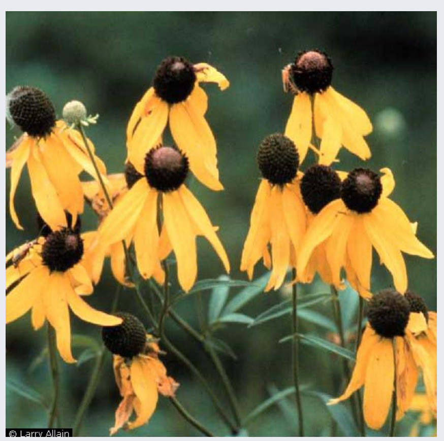
USDA NRCS Plants Database