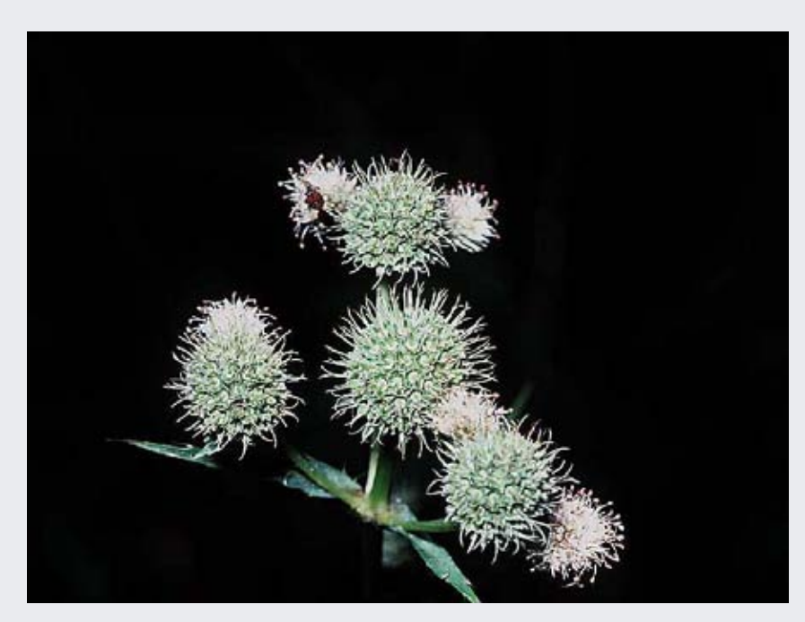
USDA NRCS Plants Database