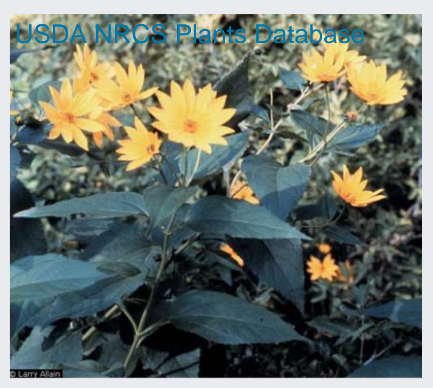
USDA NRCS Plants Database