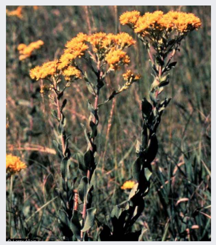
USDA NRCS Plants Database