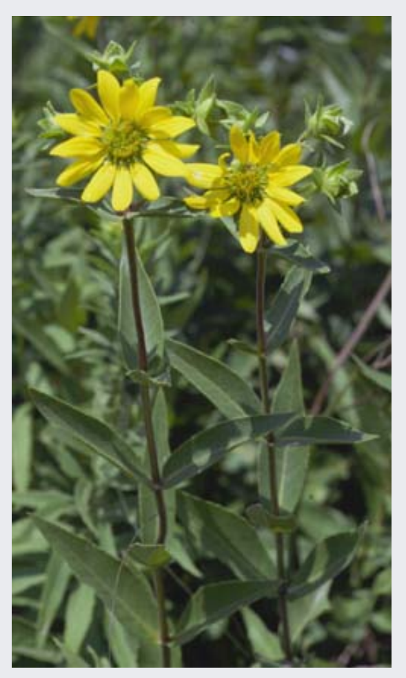
Illinois State Museum