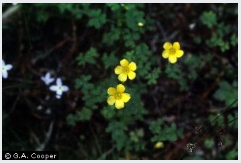
USDA NRCS Plants Database