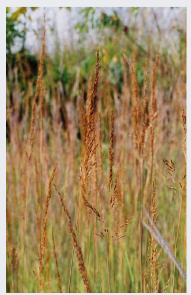
USDA NRCS Plants Database