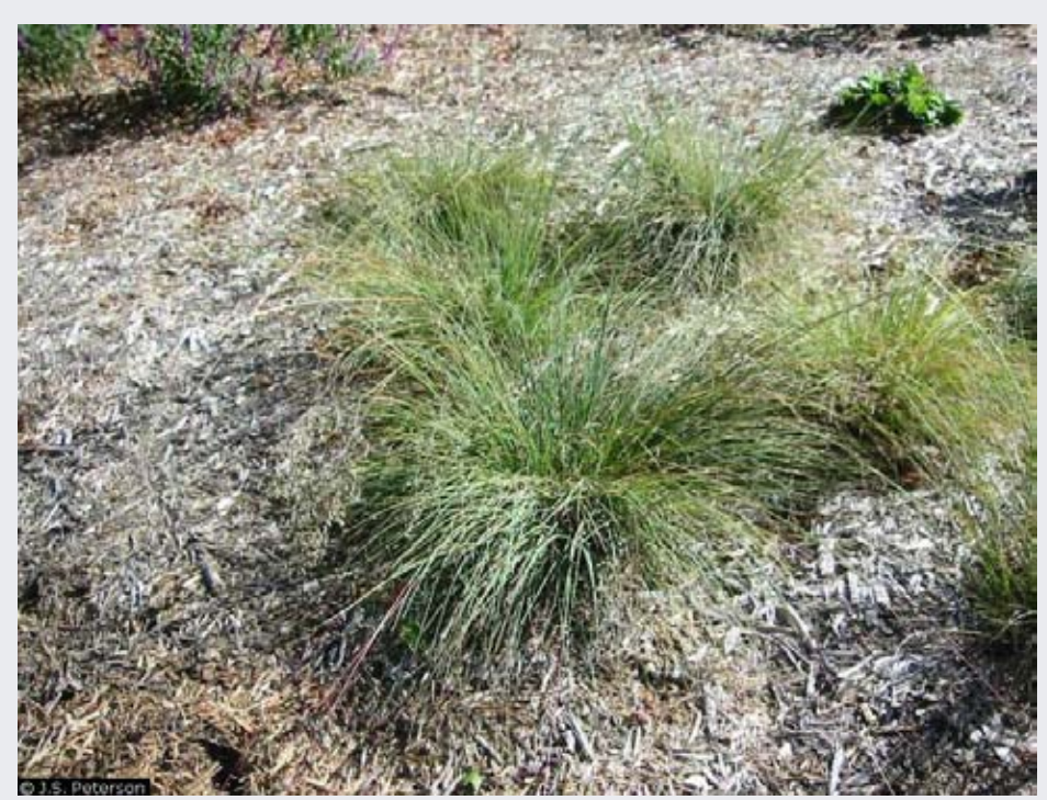
USDA NRCS Plants Database