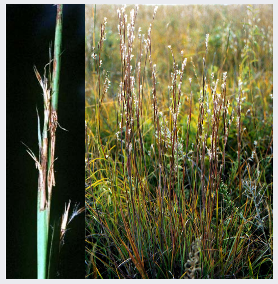
USDA NRCS Plants Database