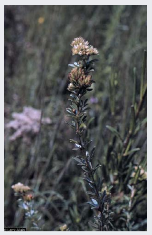
USDA NRCS Plants Database