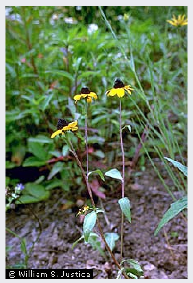
USDA NRCS Plants Database