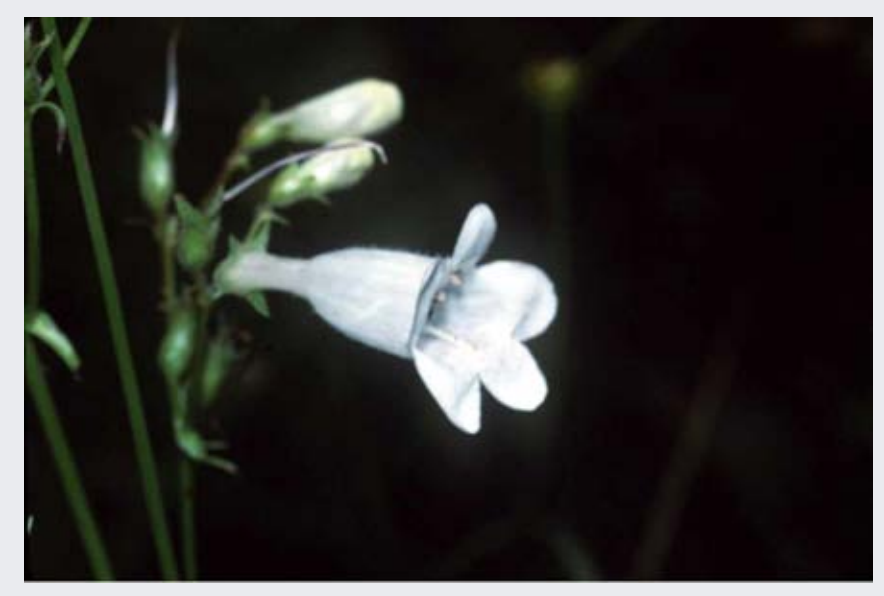
USDA NRCS Plants Database