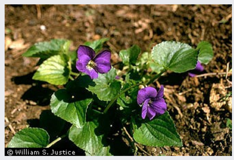
USDA NRCS Plants Database