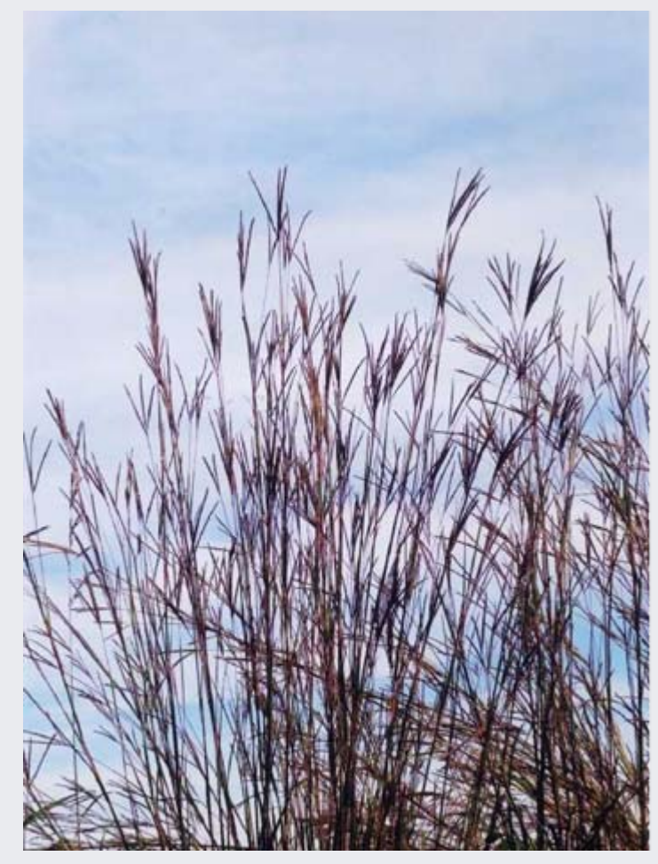
USDA NRCS Plants Database