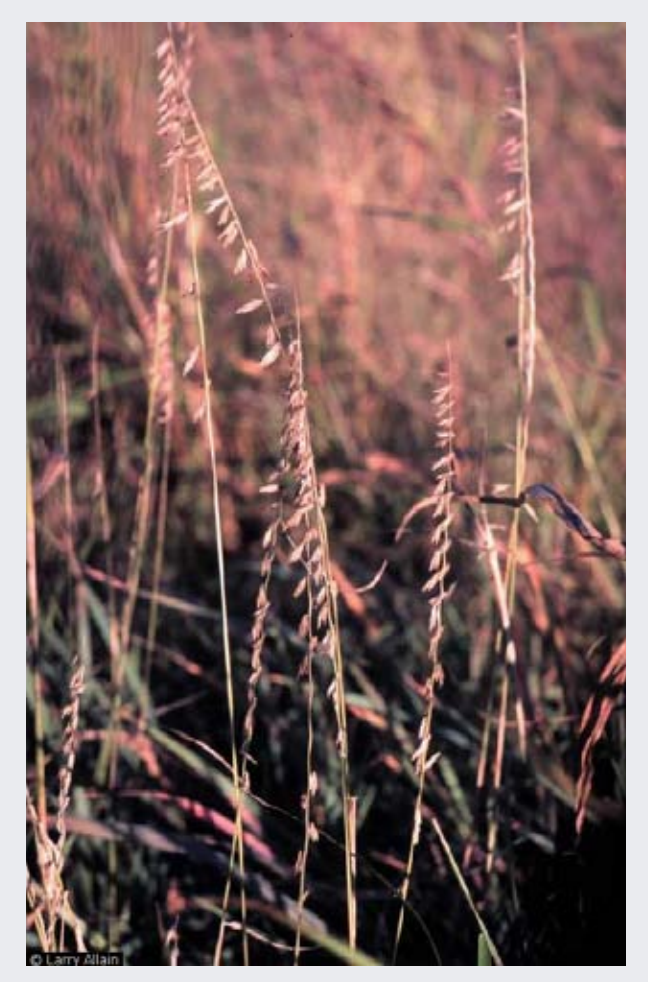
USDA NRCS Plants Database