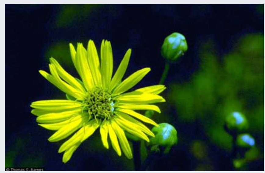
USDA NRCS Plants Database