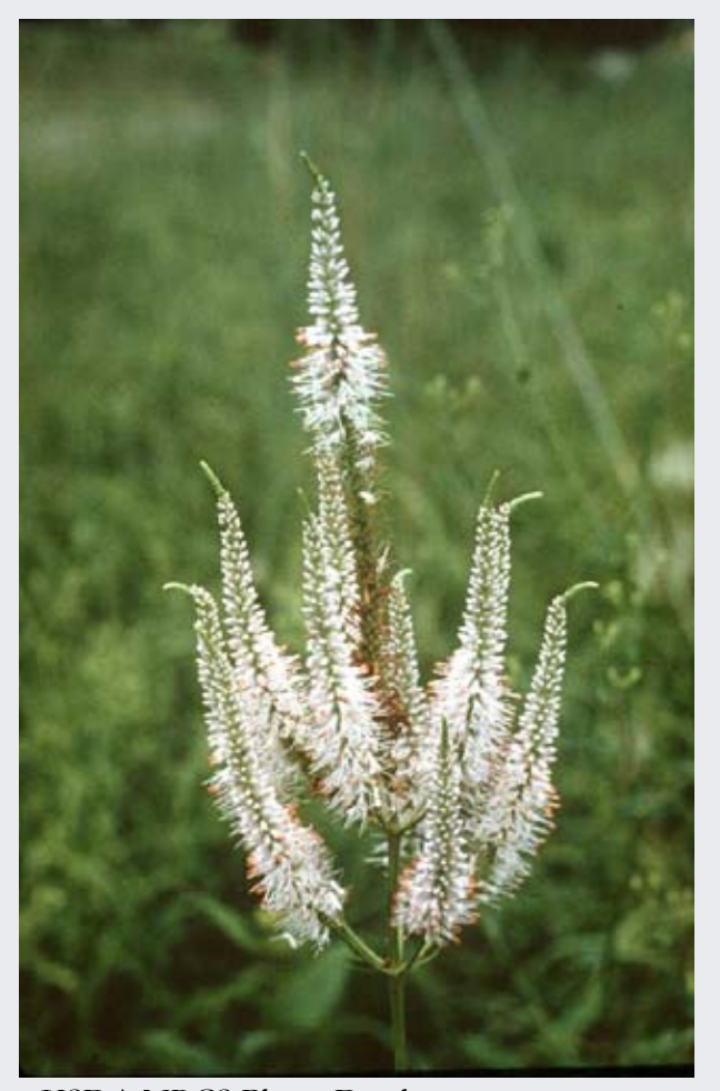
USDA NRCS Plants Database