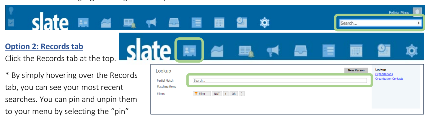
image that appears to the right of their name when you hover over it.

On the Slate Dashboard, use the Lookup Bar in the upper right corner to search for individual records. Start typing and all similar names will begin generating in the drop-down menu.