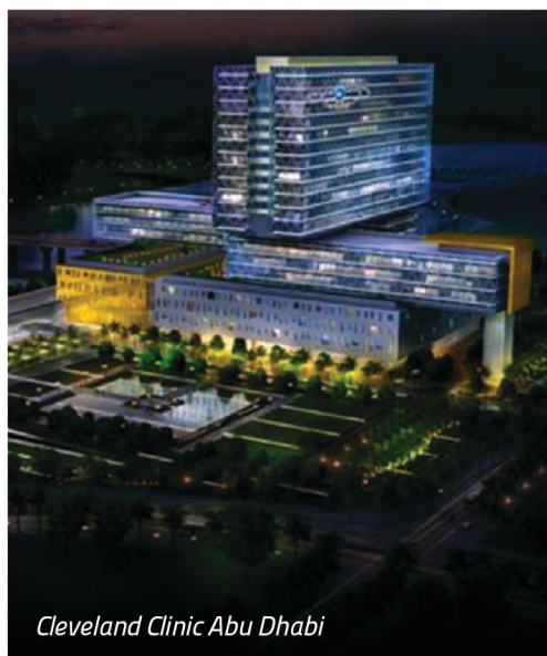
Cleveland Clinic Abu Dhabi