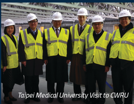
Taipei Medical University Visit to CWRU