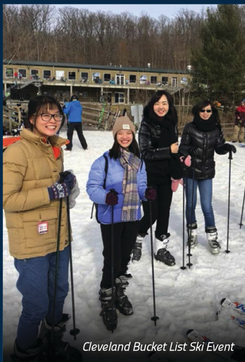
Cleveland Bucket List Ski Event