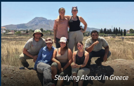
Studying Abroad in Greece