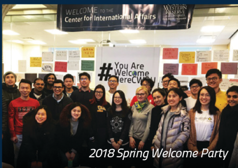
2018 Spring Welcome Party