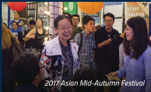
2017 Asian Mid-Autumn Festival