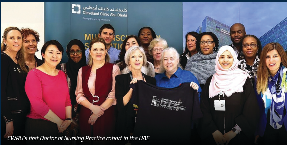
CWRU's first Doctor of Nursing Practice cohort in the UAE