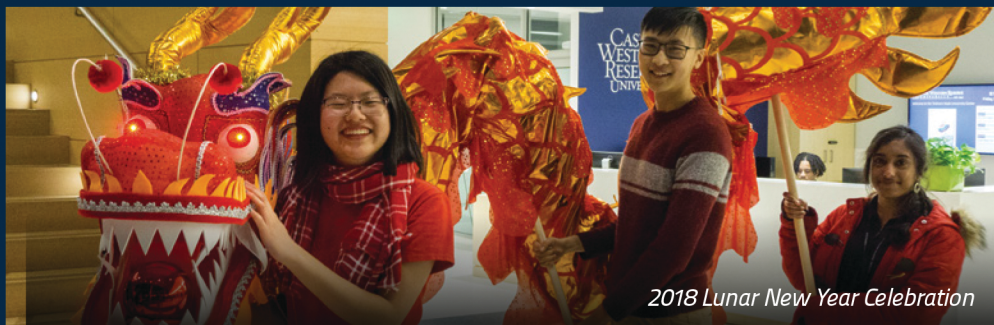
2018 Lunar New Year Celebration