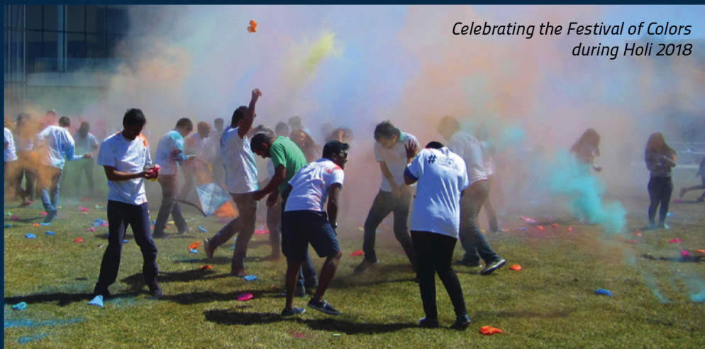
Celebrating the Festival of Colors during Holi 2018