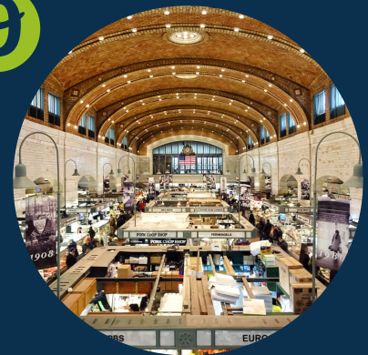
West Side Market