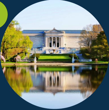
Cleveland Museum of Art