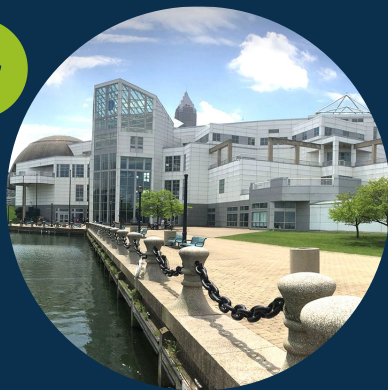
Great Lakes Science Center