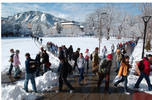
University of Colorado Boulder

The office of Institutional Analysis at the University of Colorado Boulder (CU-Boulder) administers a cycle of student surveys including NSSE to emphasize program-level data, benchmarking, student reflection on learning, and other campus goals. Results are reported publicly by college, school, division, and department. CU-Boulder also coordinates of the Association of American Universities Data Exchange (AAUDE). The AAUDE-NSSE consortium appends a set of research university-focused questions to NSSE and facilitates the sharing of student-level NSSE data among participating institutions. Information gathered from these efforts was used in the CU Boulder self-study, Shaping the New Flagship , for regional accreditation.