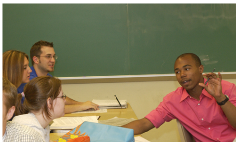
The Ohio State University

In its Self-Study Report prepared for the Engineering Accreditation Commission of ABET, Ohio State (OSU) used NSSE results as evidence for institutional level assessment-related criteria. OSU administers NSSE every three years to chart improvement on University-wide goals such as promoting academic excellence, enhancing the undergraduate experience, and maintaining a commitment to quality.