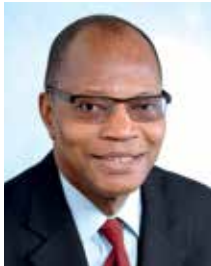
Mohamed Ibn Chambas

Mohamed Ibn Chambas ('84) was appointed in 2014 to head the U.N. Office for West Africa after serving from 2012-2014 as the joint chief mediator overseeing the Darfur peace negotiations for the African Union and United Nations. He was the international mediator who helped resolve the Liberian Civil War of the 1990s and the Ivory Coast Civil War in the early 2000s. In 2007, he was appointed to a four-year term