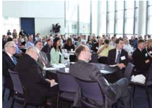
The nation's top international law experts gathered at Case Western Reserve for the conference about President Obama's legacy.

A record 180 attended the conference, which was the International Law Association's