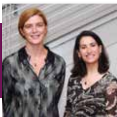
Samantha Power, now U.S. Permanent Representative to the United Nations, chats with the Editor in Chief of the Journal of International Law after delivering the Klatsky Lecture.