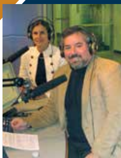
The Cox Center launches "Talking Foreign Policy," a quarterly radio program produced by WCPN 90.3 Ideastream, Cleveland's NPR station.