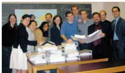
The War Crimes Research Office and War Crimes Research Lab are established.