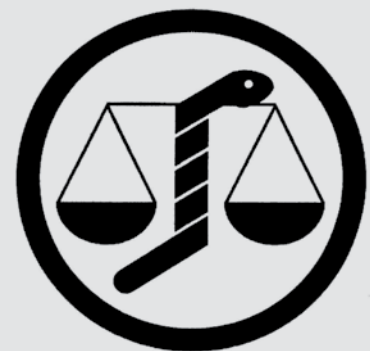
The original logo for the Law-Medicine Center, the nation's first health law program.

The law school is close to two of the nation's best hospitals — Cleveland Clinic and University Hospitals — where opportunities to work and learn in hospital legal environments are steps away.