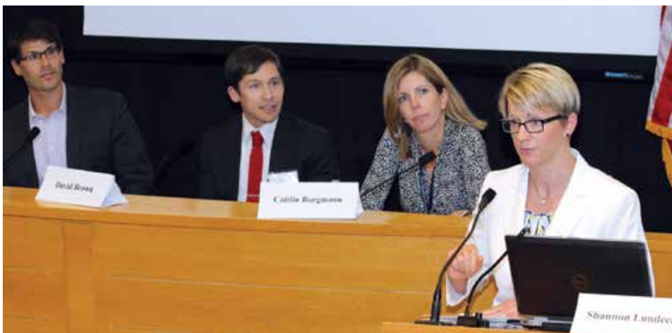
Panelists considered complex legal questions, including whether reproductive rights are best conceptualized as an aspect of privacy, liberty or equality.

The Case Western Reserve School of Law's health law journal Health Matrix will publish papers presented at the symposium.