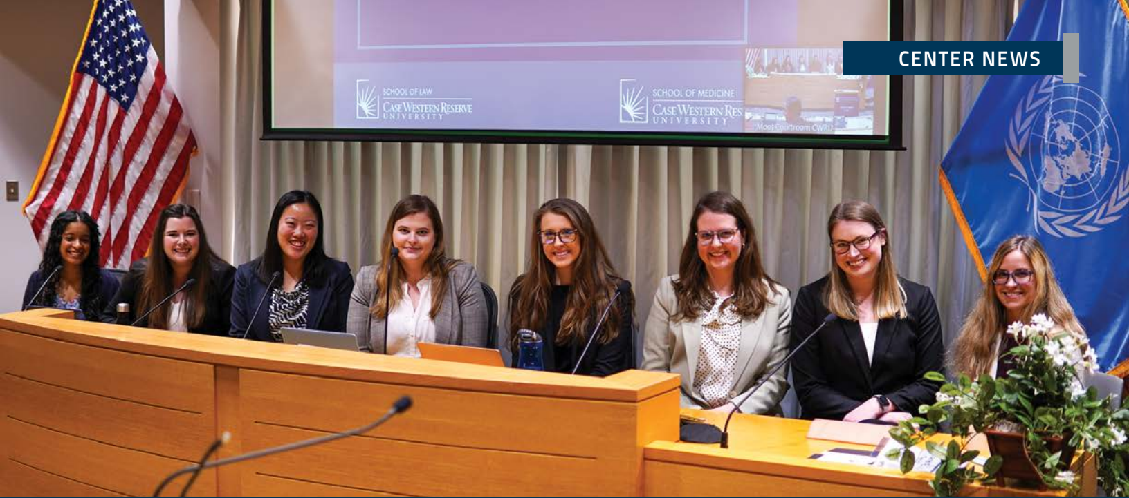
Health law students at the "Restoring Medical Professionalism: Physicians as Advocates for Their Patients" conference in March.