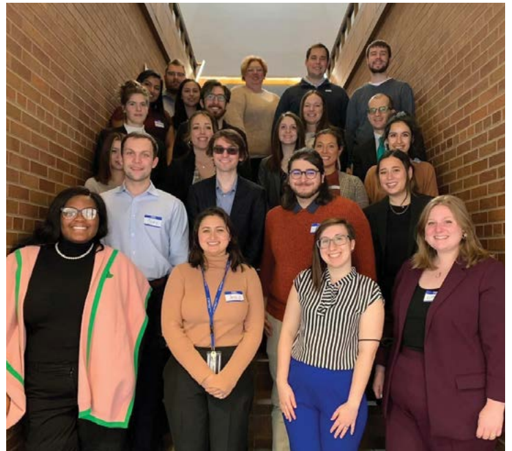
Through the Health Law Clinic, CWRU law students helped people create essential legal documents like wills.