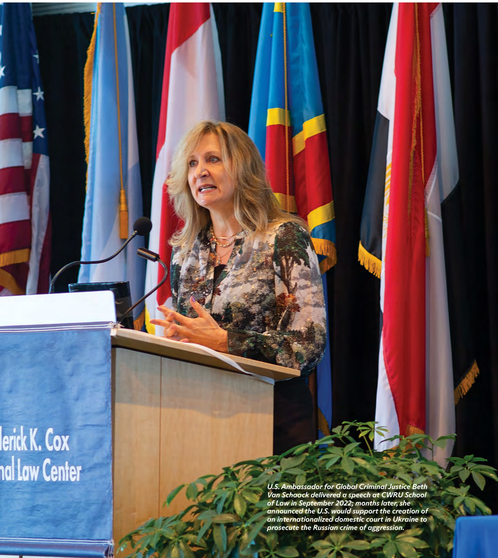
U.S. Ambassador for Global Criminal Justice Beth Van Schaack delivered a speech at CWRU School of Law in September 2022; months later, she announced the U.S. would support the creation of an internationalized domestic court in Ukraine to prosecute the Russian crime of aggression.