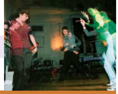
RAINBOW BOP: STUDENTS DANCE IT UP AT THIS YEAR'S LAVENDER BALL. IN THE PHOTO AT LEFT, MEMBERS OF THE PHI KAPPA THETA FRATERNITY SPIN THE TUNES.

comprehensive, ongoing effort to introduce members of the campus community to people from different cultures and lifestyles. "Part of what an education is all about is to learn about other people, to learn to be accepting and realize that people are different," says Jane Daroff. "This campus doesn't do enough to make that happen."