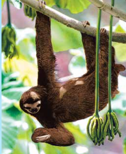
Observe mysterious creatures like the three-toed sloth in their untamed and exotic natural habitat.

In Nauta, embark the ZAFIRO and begin your voyage of discovery into one of the world's most remote regions. Gather on the ship's observation deck and watch as modern civilization fades away and the vast Amazon River unfolds before you.