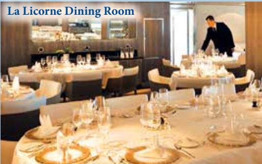
La Licorne Dining Room