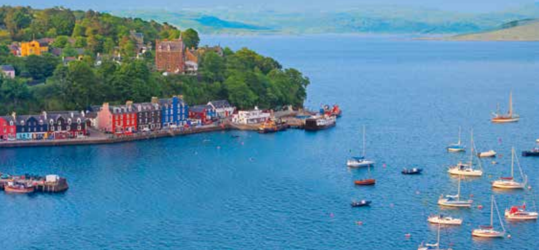
the sheltered sound in the colorful fishing port of Tobermory, capital of the Isle of Mull.

In A.D. 563, the Irish monk Columba founded a monastery here, where scribes would spend their entire lives painstakingly copying and illuminating religious tracts and transcribing ancient Celtic sagas. Iona became the burial place of Scotland's kings, including Duncan and Macbeth. Stroll through the serene, restored abbey and see the churchyard's intricate Celtic crosses.