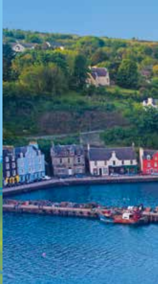
Brightly painted houses overlook the harbor.

landscape is often compared to London's Royal Botanic Garden as a "perennial Kew without the glass." Meander among spires of indigo viper's bugloss, broad-leafed tree ferns, flourishing aloes and bright pink South African suikerbos in this surprising, magical haven.