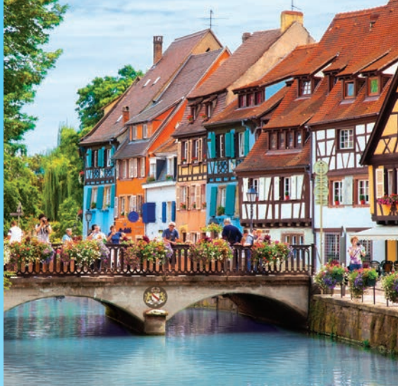
Half-timbered houses in Strasbourg's Petite-France quarter reflect the city's dual French and German character.

epitomized Germany, nestled in the densely wooded valley of the Neckar River and alive with the spirit of Romanticism.