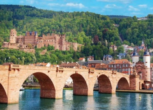
Visit medieval Heidelberg Castle overlooking the Alte Brücke and Old Town, where a bygone era lives on.

RESPONSIBILITY: Gohagan & Company, The Laura & Alvin Siegal Lifelong Learning Program, Engaging Journeys, Inc., Case Western Reserve University, and its and their employees, shareholders, subsidiaries, affiliates, officers, directors or trustees, successors, and assigns (collectively "Gohagan"), do not own or operate any entity which is to or does provide goods or services for your trip including, for example, lodging facilities, airline, vessel, or other transportation companies, guides or guide services, local ground operators, providers or organizers of optional excursions, food service or entertainment providers, etc. All such persons and entities are independent contractors. As a result, Gohagan is not liable for any negligent or willful act or failure to act of any such person or entity or of any other third party.