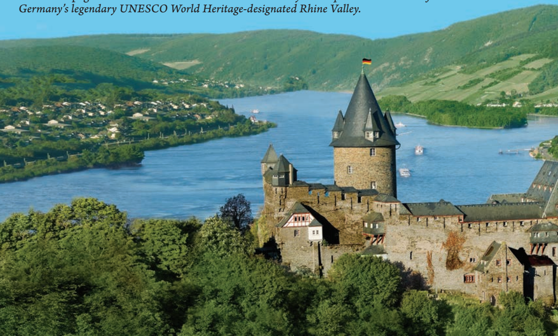
Photo this page: Medieval castles and bucolic terraced vineyards capture the romance of Germany's legendary UNESCO World Heritage-designated Rhine Valley.

Cover photo: View the unforgettable peaks of the iconic Matterhorn from the top of the highest cog railway in Europe, the world-renowned Gornergrat Bahn.