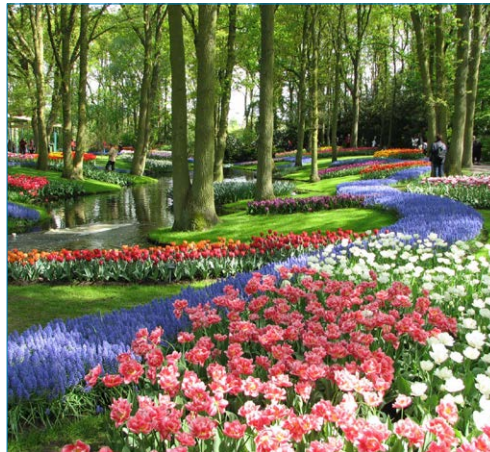
Holland Tulip Fields