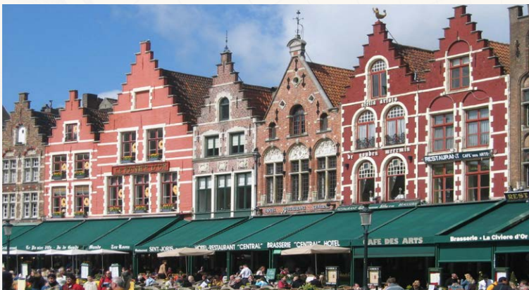
Market Square, Bruges