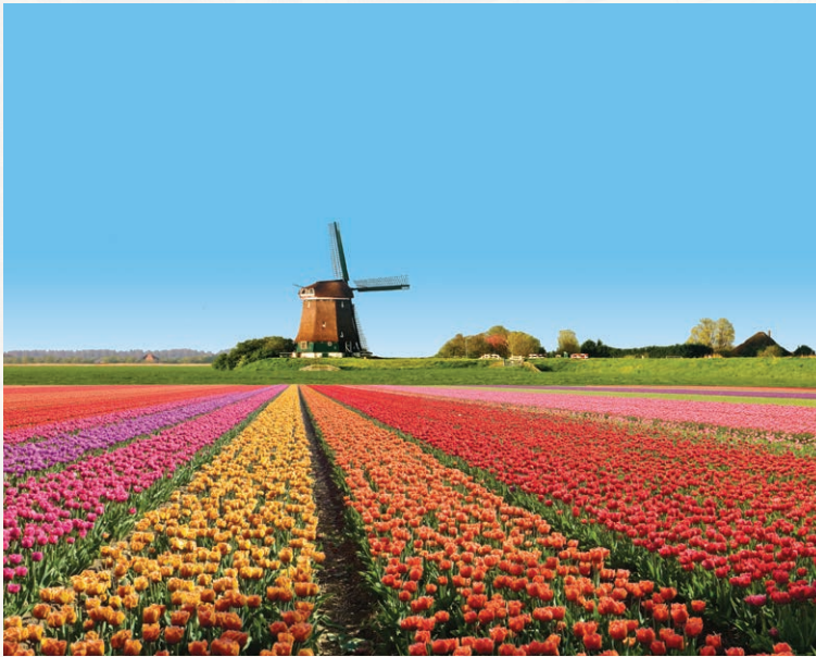
Holland Windmill and Tulip Field

Come celebrate the beauty of Holland and old-world Flanders in springtime, the best time of year to visit, when the vibrant, abundant Dutch tulip fields are in bloom. Join us for this comprehensive nine-day travel program and cruise for seven nights along the Dutch waterways aboard the exclusively chartered, deluxe, small river ship AMADEUS BRILLIANT. Meet local residents during the exclusive RIVER LIFE® FORUM for a personal perspective of daily life and cultural heritage in the Low Countries. Enjoy a private cruise along the enchanting canals of Amsterdam, a UNESCO World Heritage site. Expert-led excursions include the storybook city of Bruges, the world-renowned Kröller-Müller Museum, famous Keukenhof Gardens, the “Golden Age” trading town of Hoorn, ancient Maastricht and charming Antwerp. The Delft, Kinderdijk and The Hague Pre-Cruise Option and the Golden Age of Amsterdam Post-Cruise Option are offered. This delightful itinerary is an exceptional value including all accommodations, excursions and meals. It sells out quickly year after year and is continually praised by our past travelers as the ideal Dutch and Flemish experience.