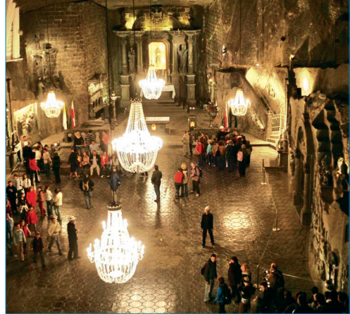
Wieliczka Salt Mine