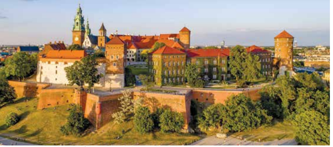
Visit Wawel Castle, Poland's history-wrapped national symbol, and experience the extraordinary artistry and spiritual potency of Kraków's Royal Cathedral of Saints Stanislaus and Wenceslaus.

Admire the Royal Castle's magnificent Canaletto Room's lauded paintings by Bernardo Belloto (better known in Poland as Canaletto).