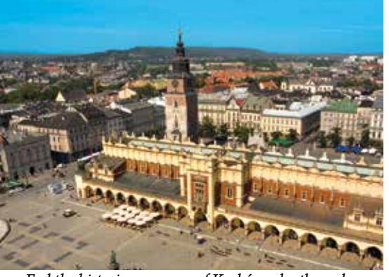
Feel the historic resonance of Kraków echo through the Cloth Hall where commercial traditions still prevail.