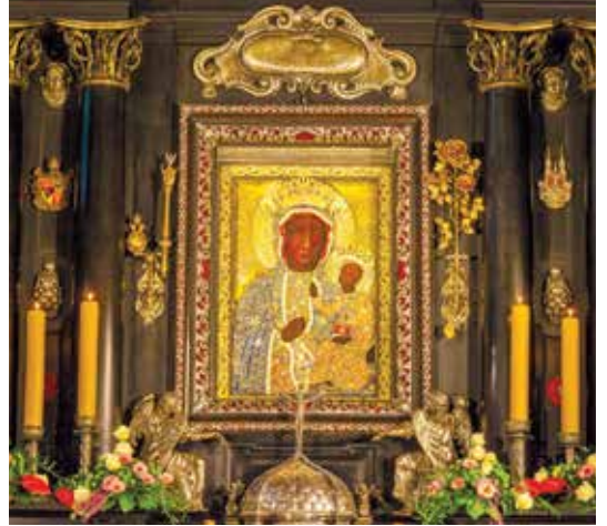
Experience the palpable aura of veneration that surrounds the Black Madonna of Częstochowa.

Castle Square is the nation's historic stage for momentous events, including where, in 1997, former U.S. President Bill Clinton formally welcomed Poland as a member of NATO. Dominating the square, the monumental red-brick Royal Castle was a stronghold of the dukes of Mazovia in the 14<sup>th</sup>-century and became one of