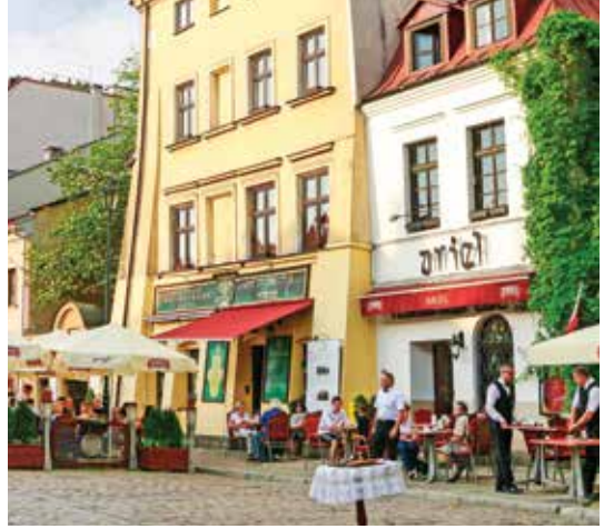
Trace Kraków's Jewish history from the 12<sup>th</sup> century to the present day in Kraków's evocative Kazimierz quarter.