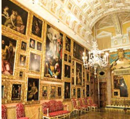
Isola Bella's Palazzo Borromeo showcases the works of Giulio Cesare Procaccini and Luigi Pellegrini Scaramuccia.