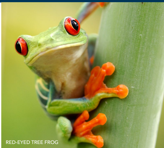
RED-EYED TREE FROG