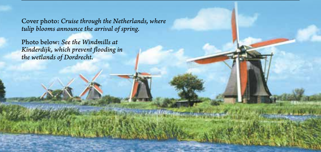
Photo below: See the Windmills at Kinderdijk, which prevent flooding in the wetlands of Dordrecht.

Cover photo: Cruise through the Netherlands, where tulip blooms announce the arrival of spring.