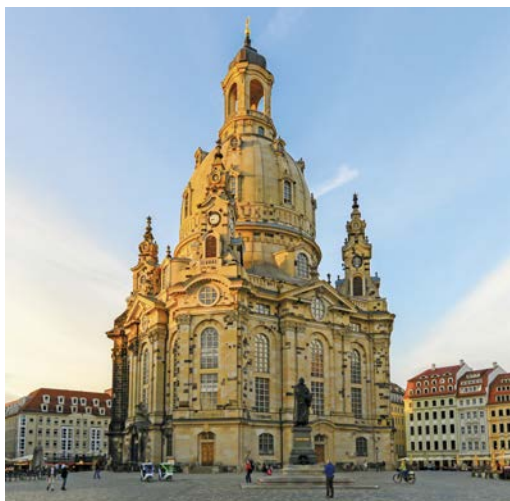
Church of Our Lady, Dresden

Enrichment: Velvet Revolution. Discover how this pivotal movement in 1989 freed the former Czechoslovakia from communist control.