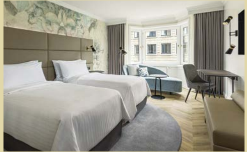
The Westin Grand Berlin