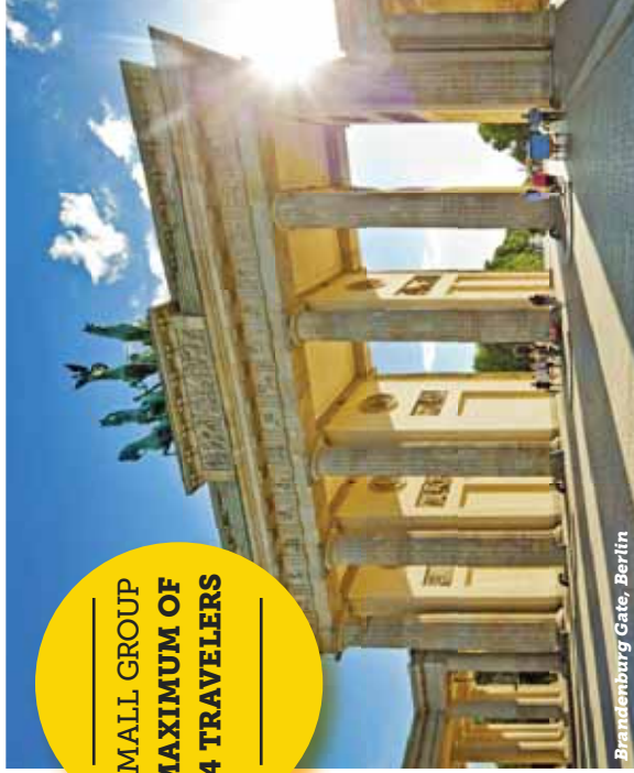
Brandenburg Gate, Berlin