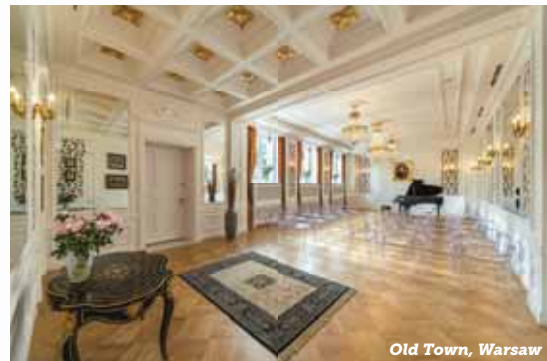
Old Town, Warsaw