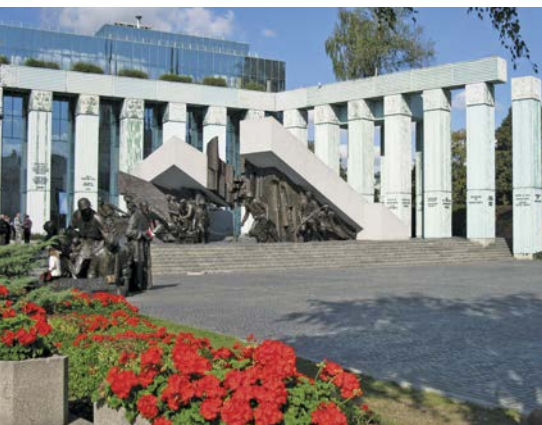
Warsaw Uprising Monument

Free Time: Pursue your own interests this afternoon or choose to join the Elective Activity.