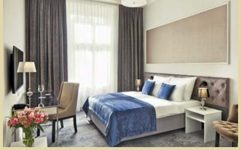
Hotel Unicus Palace | Kraków