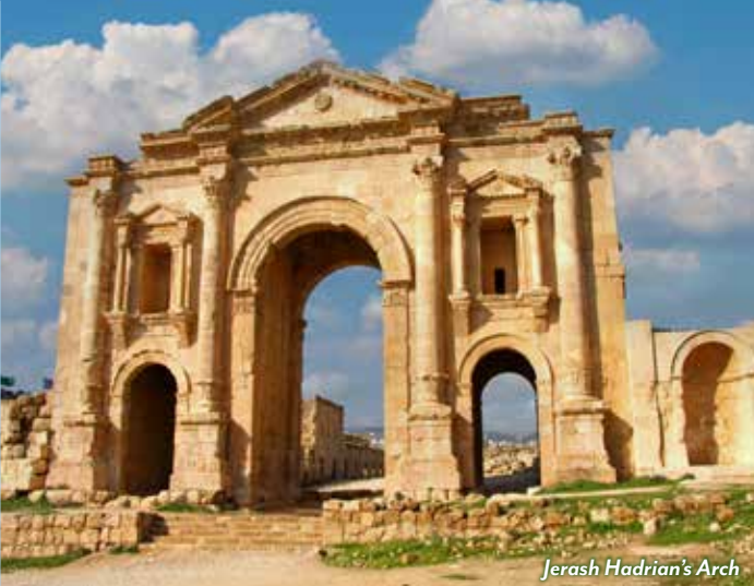
Jerash Hadrian's Arch