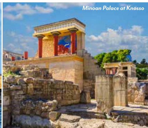
Minoan Palace at Knossos