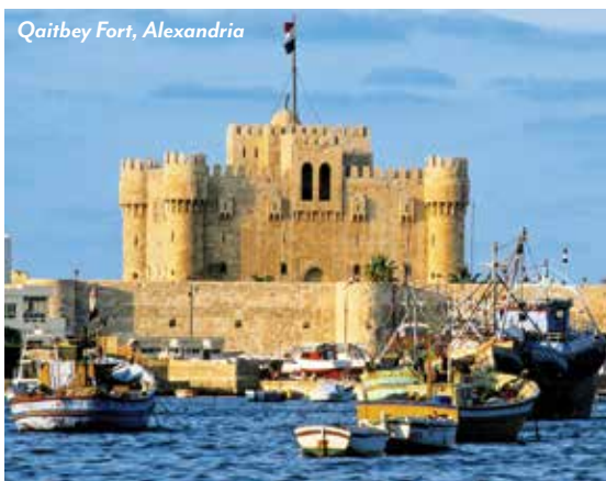
Qaitbey Fort, Alexandria

Disembark the ship and join the Ancient Greece Post-Program Option, or transfer to the airport for your flight home. (B)