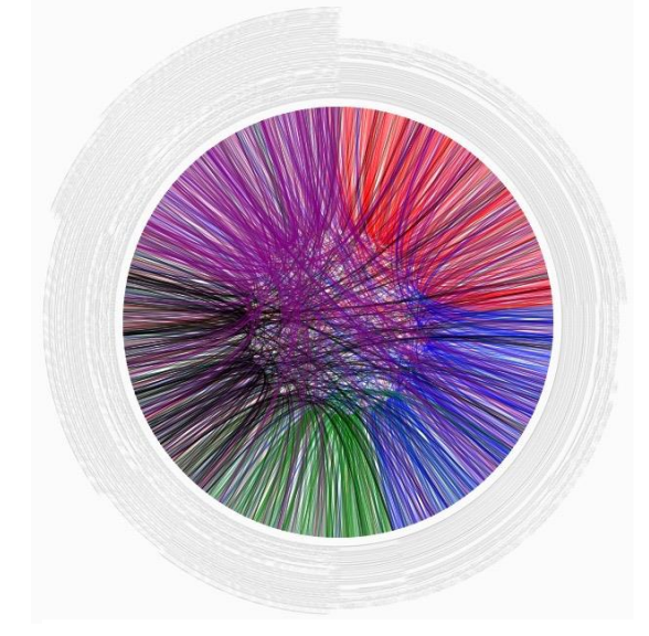
Rashi's Connections

This system of connections through hyperlinks opens up opportunities for rich, broad study. Still, I can't help but think that something is lost when the process of learning and discovering happens by clicking on electronic screens, rather than wandering through a library, pulling volumes off shelves, surrounding yourself with them at your desk, and flipping between them.