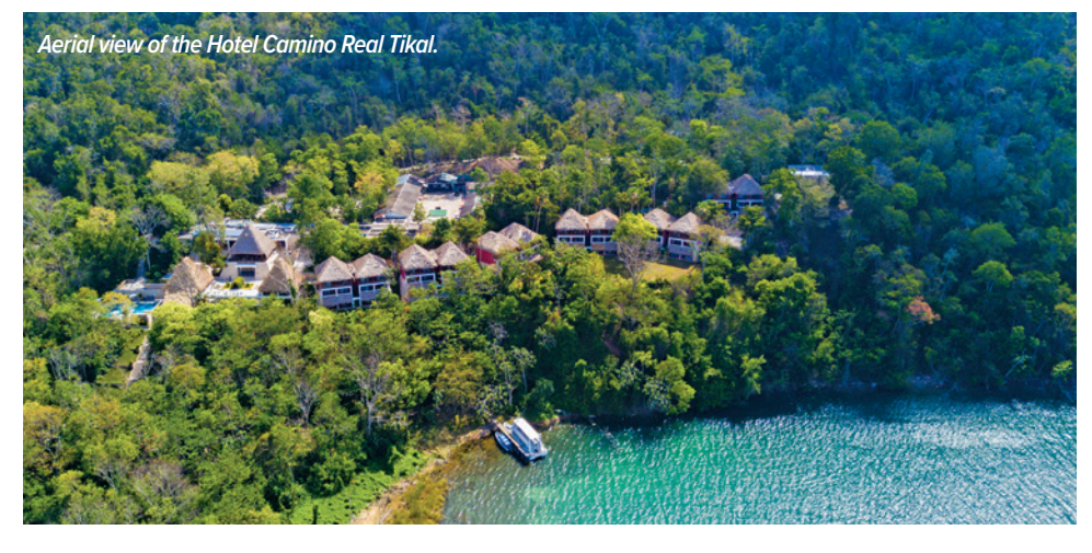
Opposite page (clockwise from top): Gartered trogon; sunrise and morning mist at Tikal; Temple 1 in Tikal; explore the little-visited Maya ruins at Yaxhá; white-nosed coati in Tikal National Park.

Spend three nights at the beautiful Hotel Camino Real Tikal, your home base while you explore the Maya culture and ruins. The hotel is nestled in the rainforest, where you can enjoy the many different species of birds while on an optional bird walk with your naturalist or relax on a sunset boat ride on Lake Petén Itzá