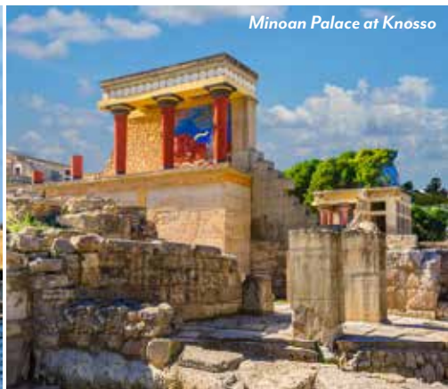
Minoan Palace at Knossos