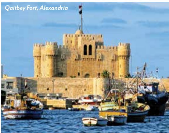
Qaitbey Fort, Alexandria

Disembark the ship and join the Ancient Greece Post-Program Option, or transfer to the airport for your flight home. (B)