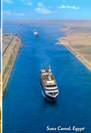
Suez Canal, Egypt

Walk along the avenue of the ram-headed sphinxes into the Great Court and then continue to the Luxor Temple. (B,L,D)