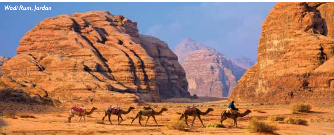
Wadi Rum, Jordan

Travel into the mountains and across the arid desert to Luxor to see the great temples of ancient Thebes. Arrive in Luxor and enjoy an overnight stay in a Nile-view room. Explore UNESCO-designated Thebes with a visit to the magnificent Karnak Temple complex.