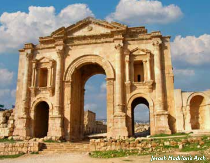
Jerash Hadrian's Arch