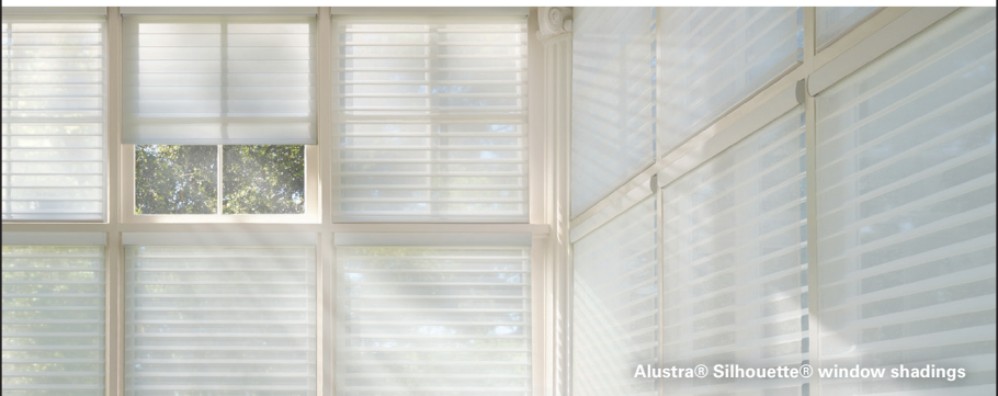
Alustra® Silhouette® window shades

Proud to sponsor an Evening with Mandy Patinkin and Kathryn Grody