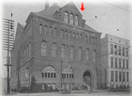
Western Reserve School of Medicine - 1890s