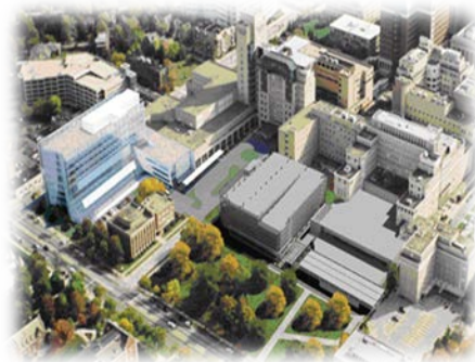
UH Case Medical Center Campus – 2011