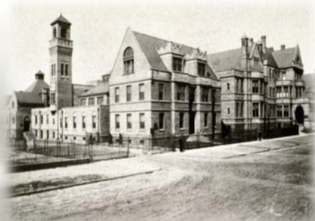
Lakeside Hospital in downtown Cleveland – 1890s