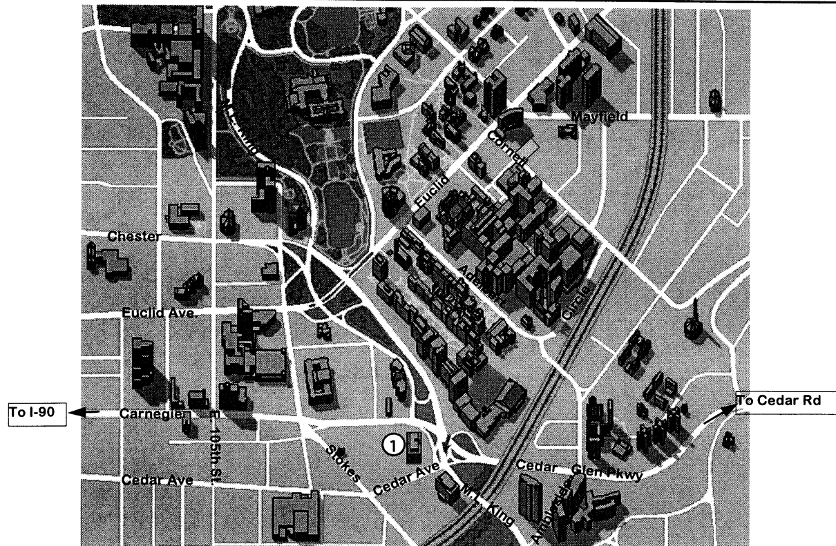
1. Cuyahoga County Coroner's Office (aka UCRC II)

From the west via the Ohio Turnpike (Interstate 80), go east on the turnpike and exit at Interchange 142. Follow Interstate 90 east. At I-90 Exit 173B, turn RIGHT onto Ramp towards Carnegie Ave. Continue east on Carnegie Avenue to E. 105 th Street. Turn right and take E. 105 th Street south to Cedar Avenue. Turn left and go east on Cedar Avenue. The next major intersection is Stokes Blvd. Cross Stokes, then start looking on your left for the sign, "Cuyahoga County Coroner's Office" (11001 Cedar Avenue) on your left.