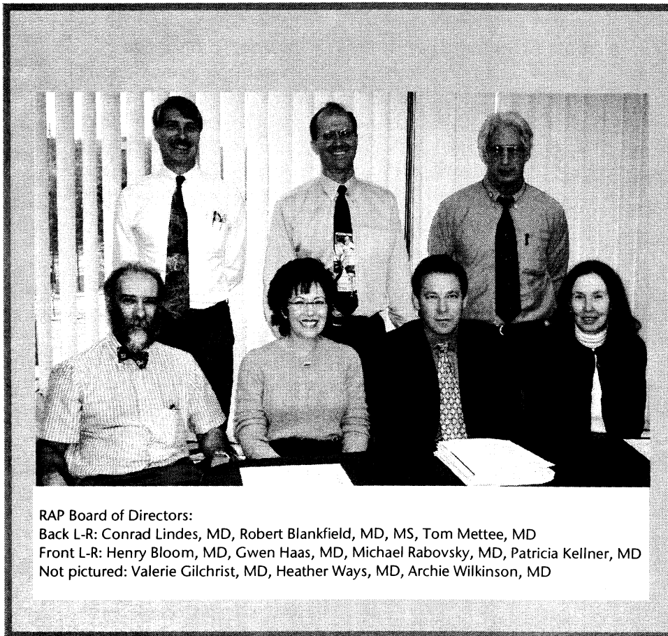
RAP Board of Directors: