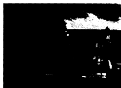
The UH Extended Care Campus

"THE IMPROVEMENT PROCESS IS ABOUT BREAKING A LARGE PROBLEM DOWN INTO SMALL STEPS IN ORDER TO COME UP WITH CREATIVE SOLUTIONS TO FIX IT"