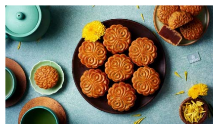
Mid-autumn Festival Oct 1

Many organizations host HLM events that may include literacy education workshops for healthcare workers, instructional sessions for patients about their medications, health literacy newsletters, and health fairs. You can download a free <a href="Health Literacy Month">Health Literacy Month</a> Handbook on their website for ideas and resources to create a Health Literacy Month event.