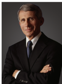
Dr. Anthony Fauci