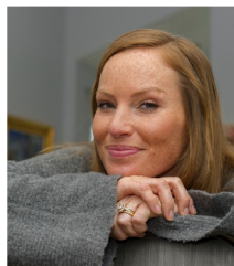
Mina Starsiak Hawk