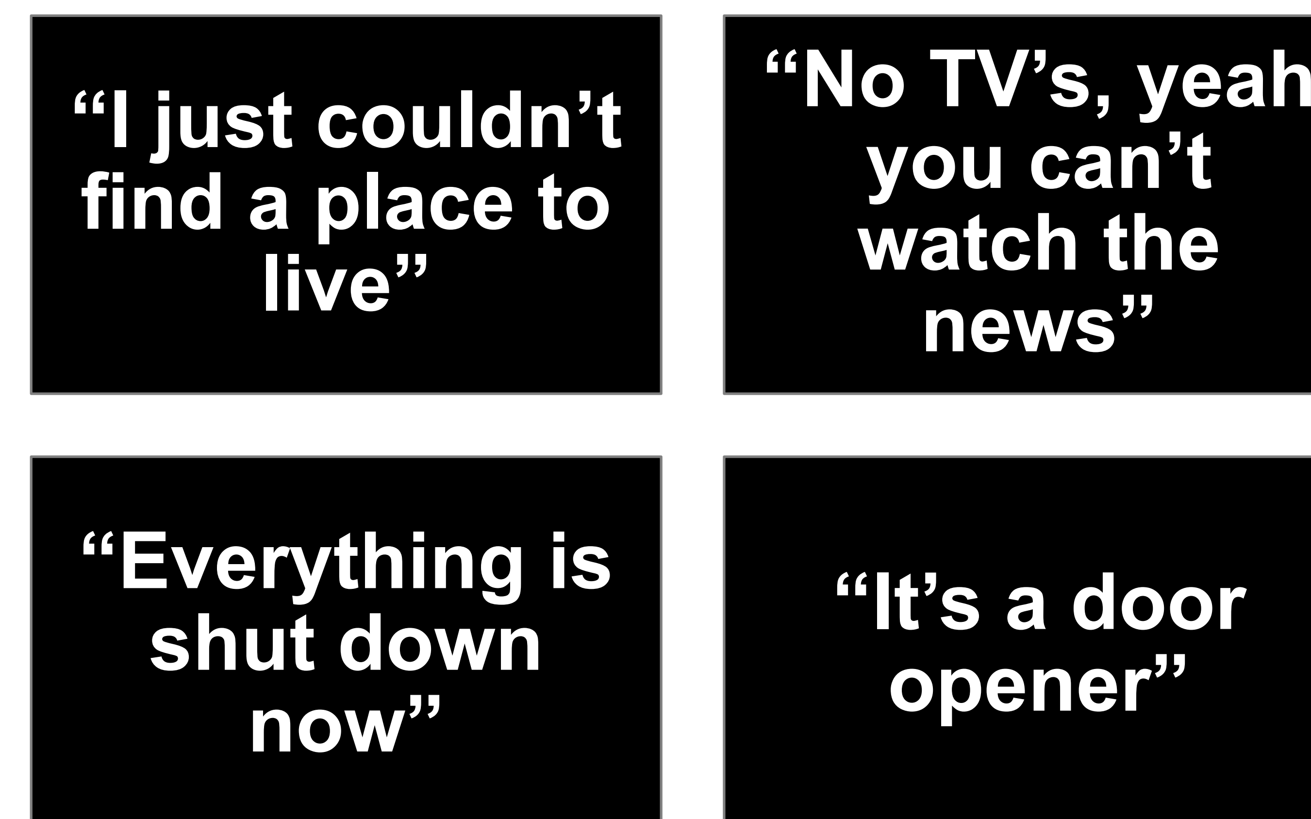
Figure 2. Themes that emerged from interviews with participants