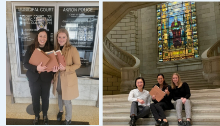
Figure 3 & 4: Filing in Cuyahoga County & Summit County Probate Court